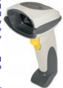
(Figure 1—2D Scanner)

In the trial, the GP computer system automatically captures all